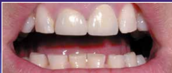
Bruxing can wear down and destroy your teeth.

Do you wake up with a stiff, tired jaw? Are your teeth sensitive to cold drinks? If you answered yes to either of these questions, you may be grinding or clenching your teeth during sleep. Grinding of the teeth is a medical condition called bruxism. Over time, bruxism will result in the wearing down of your natural tooth enamel.