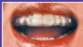
Nightguards are custom-made and easy to insert or remove.

In addition to relieving head, neck, jaw joint, and shoulder pain, it will protect your existing teeth and your dental restorations. It is highly recommended for those who have crowns, bridges, implants and dentures to offset the effects of this often-subconscious habit that occurs during sleep.